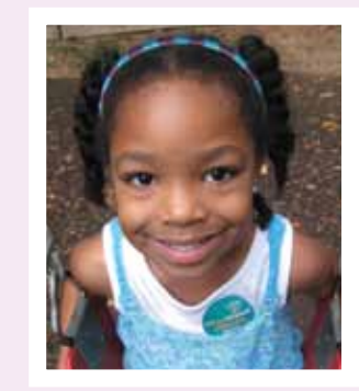
A student smiles following her vision screening.

• Editing the vision section and providing the vision screening